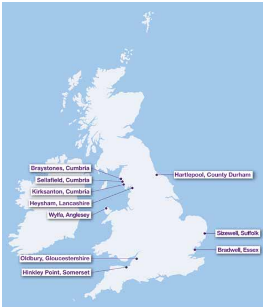
Figure S.2.1 Potentially Suitable Sites

S.2.10 The draft Nuclear NPS sets out the Government policy on the role of new nuclear power in the energy mix, the Government's assessment of the arrangements for managing and disposing of radioactive waste from new nuclear power stations, and a list of sites which the Government considers to be potentially suitable for new nuclear power stations. The list of sites in the draft Nuclear NPS has been developed using a Strategic Siting Assessment (SSA) process with exclusionary and discretionary criteria to identify sites that are potentially suitable for the deployment of one or more new nuclear power stations by the end of 2025. Nominations for sites were invited and eleven nominations were received by the end of March 2009; these were taken forward for the SSA process. Sites that passed the exclusionary criteria were then subject to assessment using the discretionary criteria and were also appraised using the AoS and HRA processes. As a result of these assessments, the draft Nuclear NPS includes a list of ten sites that are considered to be potentially suitable for new nuclear power stations to be in operation by 2025. The following figure shows the location of the ten sites included in the draft Nuclear NPS.